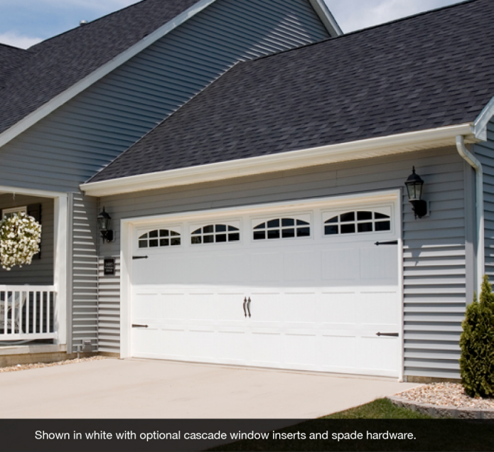
Shown in white with optional cascade window inserts and spade hardware.