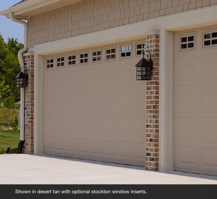
Shown in desert tan with optional stockton window inserts.